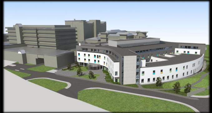
The Baird Family Hospital & The Anchor Centre, Aberdeen 2021 - 2022