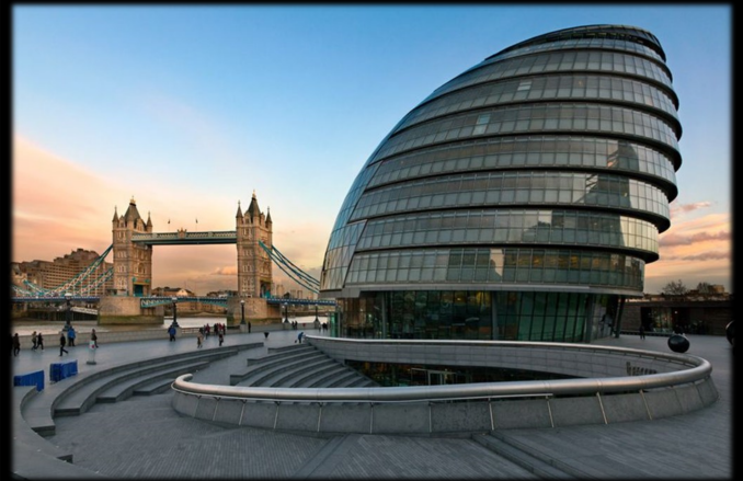
GLA Building, Tower Bridge London 2002