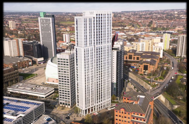
Altus House, Leeds The tallest building in Yorkshire 2020

Awarded Gold Medal for Occupational Health and Safety 2015