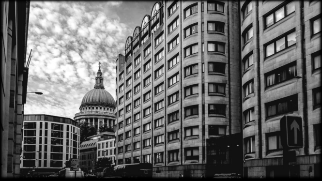
BT Headquarters, London