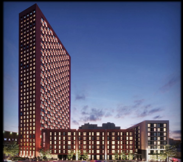
The Square, Birmingham Hotel and Private Residential 2021 - 2022