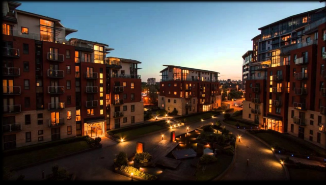
City Island, Leeds