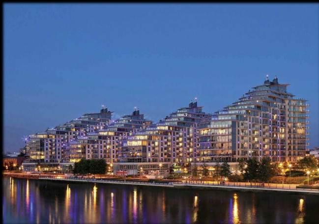
Battersea Reach, London