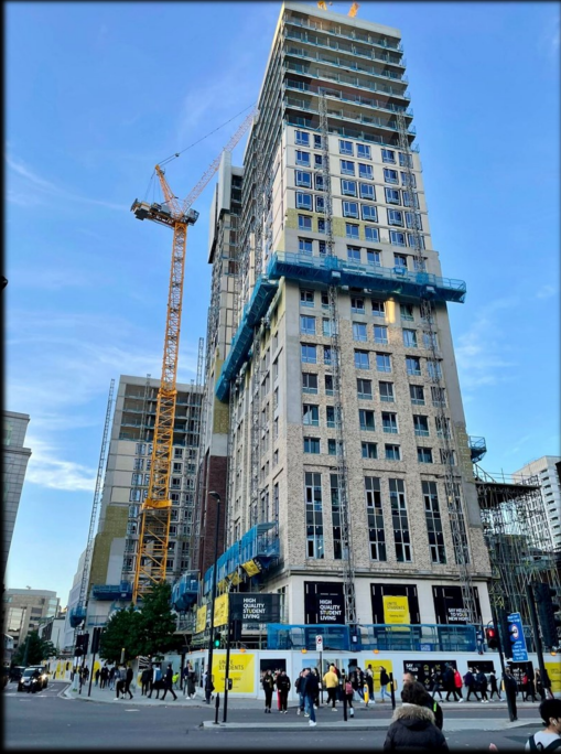
Middlesex Street Student Accommodation, London 2021