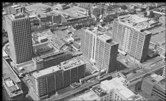
Whitgift Centre, Croydon