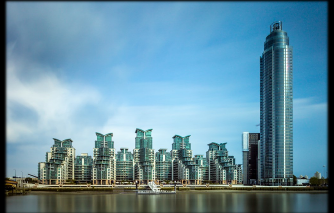
St. George Wharf Tower Tallest residential building in Europe at the time of build 2010 - 2012