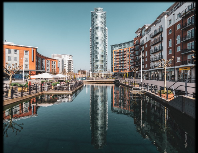
East Side Plaza, Gunwharf Quays, Portsmouth The tallest tower along the South coast to date 2005