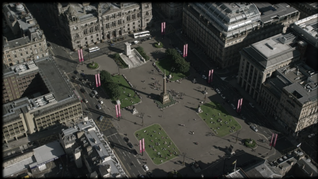
St. George Square, Glasgow