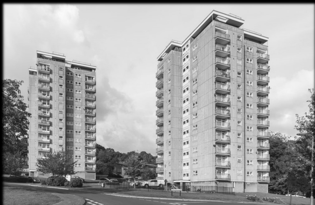
Tower Blocks, Dorking