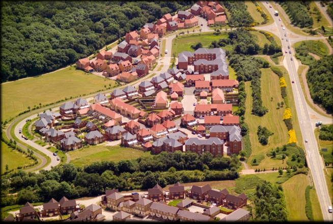
Medbourne Park, Milton Keynes First Stephenson Developments Project February 2001