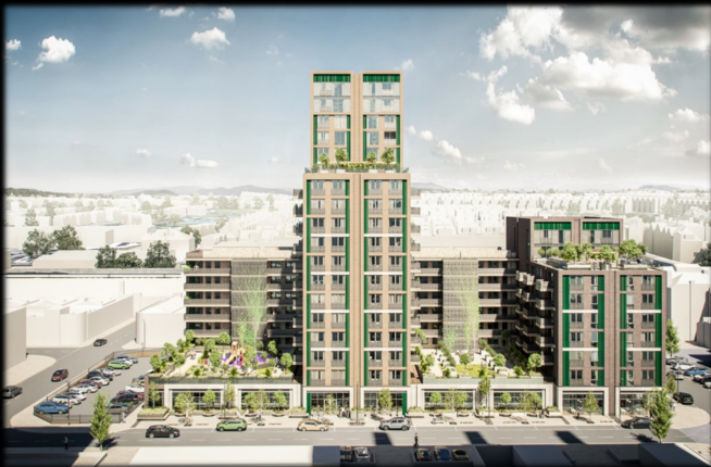
Hove Gardens Built to Rent & Commercial 2021 - 2022