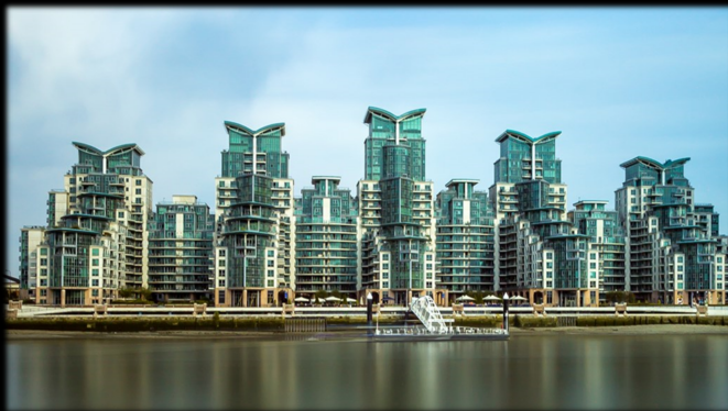
St. George Wharf, London 2003 - 2009